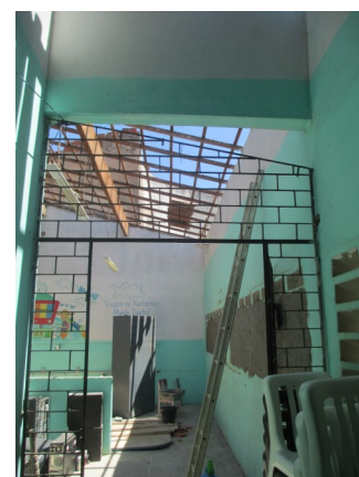
Brick vents filled in, new insulated door installed.