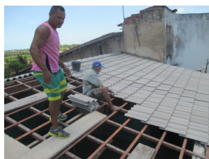
New roofing tiles