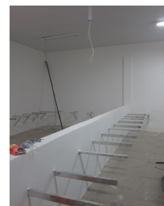
Ceiling & painting & installation of counters